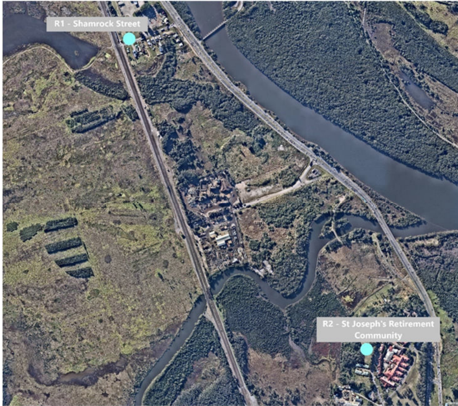
Figure 1 InfraBuild Site and Receiver Locations