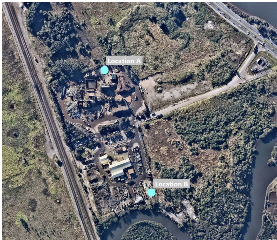
Figure 2 Site Boundary Measurement Locations